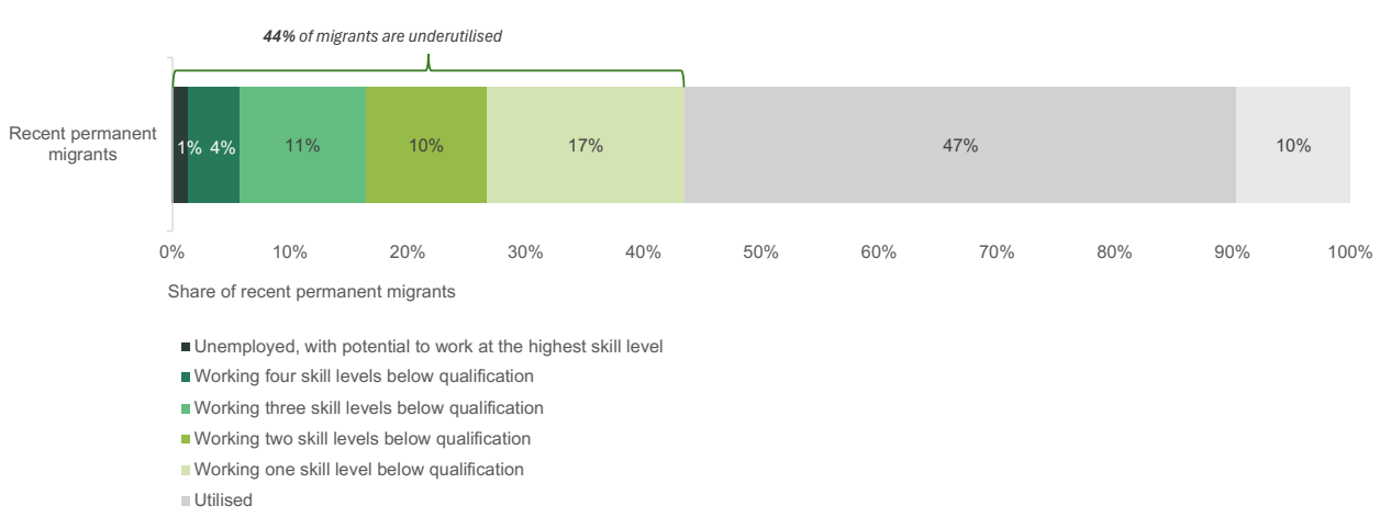
Chart 2: Extent of underutilisation (share of recent migrants in the labour force)

Overutilised, or unobserved work experience