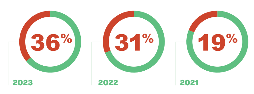
Chart 1: Proportion of occupations in shortage 2021 to 2023.

Research found that migrant women were 1.2 times more likely to be underutilised compared to their male counterparts